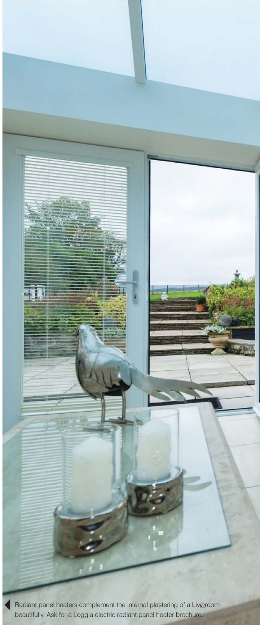
◀ Radiant panel heaters complement the internal plastering of a Living room beautifully. Ask for a Loggia electric radiant panel heater brochure.