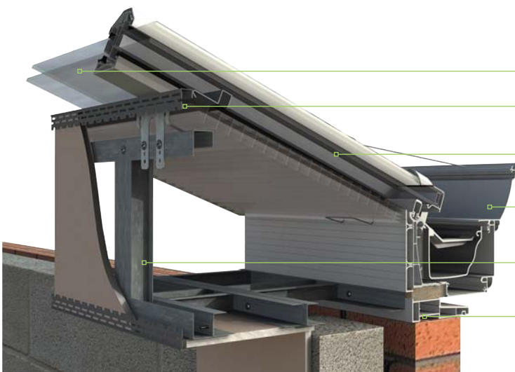
▲ Cornice and LivingRoom on brick columns

Livingroom uses an Ultraframe Classic glazed roof to which is attached a steel work ladder system at eaves and glazing bar positions. This is then plasterboarded and plaster skimmed to form a perimeter ceiling.