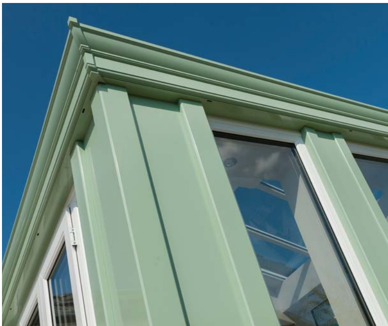
Cornice can be used with brick columns or with super insulated Loggia columns ▲

Change the visual dynamics externally too by using Cornice for a smooth finish at the wall/roof interface.