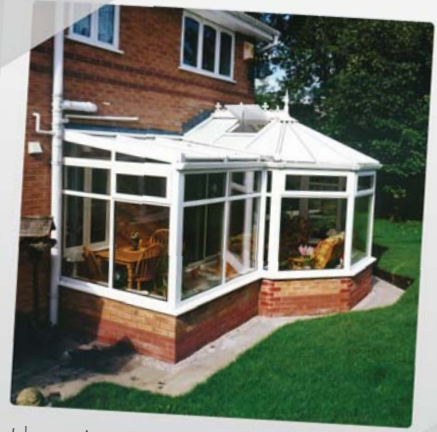
Upgrade your P-Shape conservatory

A. An existing conservatory with doors into the house is 'exempt' from Building Regulations but changing the roof to a solid one means that Building Regulations now apply. Don't worry, your Ultraframe retailer will take care of everything.