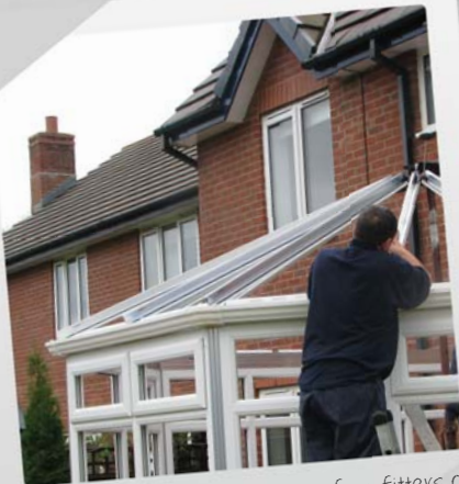
Living Roof uses the Classic roof so fitters can swap old for new very quickly

A. It is perfectly feasible to change simple designs over the course of one day – plaster boarding and skimming would then take place over the next day or so. Ultraframe retailers will protect any existing finishes during the project.