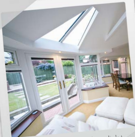
LivingRoof's versatility allows light into adjacent rooms

A. LivingROOF has the option to have inserted in virtually any position glazed panels to allow light into the existing home. These glazed panels can be inserted at virtually no additional cost.