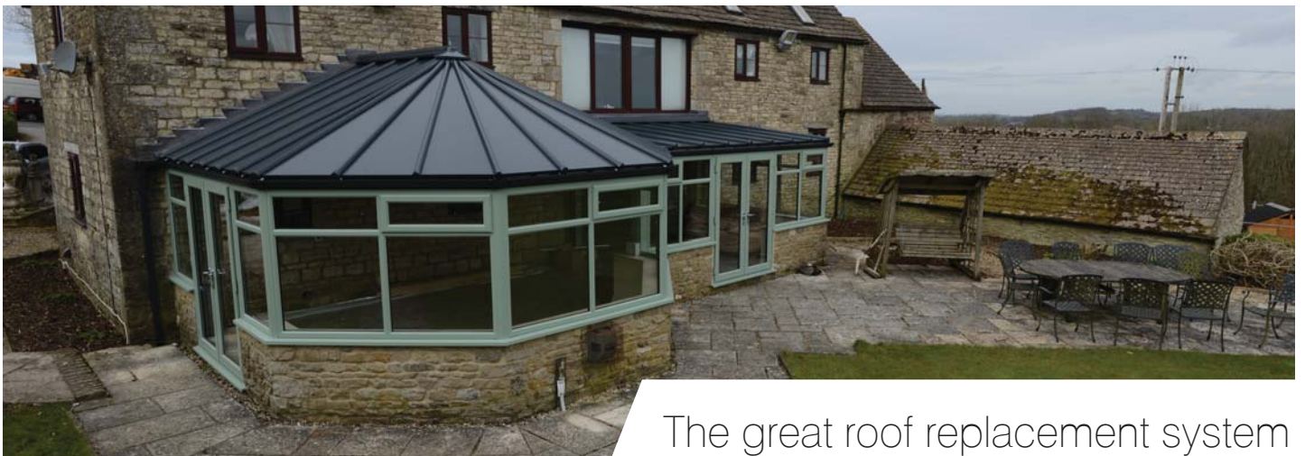
The great roof replacement system