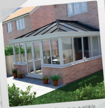
LivingRoof's Cornice feature is available in grey (to match the roof) or white

A. The roof comes as standard with black 'ogee' pvc shaped gutter – this is the lowest cost option. Alternatively, we offer a powder coated aluminium Cornice which adds a decorative feature between the existing windows and the new roof, hiding the gutter and the ends of the glazing bars.