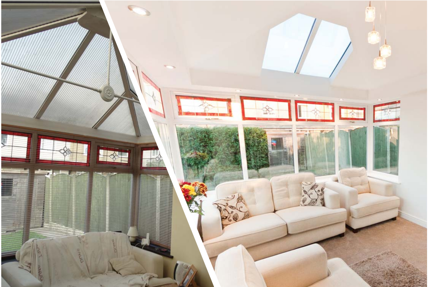
BEFORE the transformation